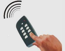
Remote control keypad